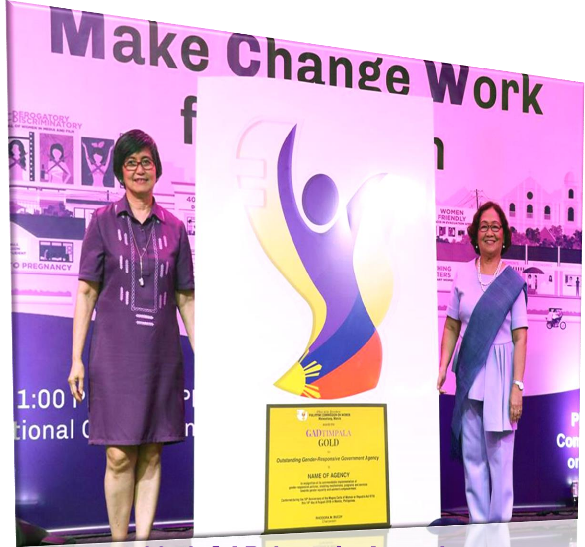
2018 GADtimpala Awards