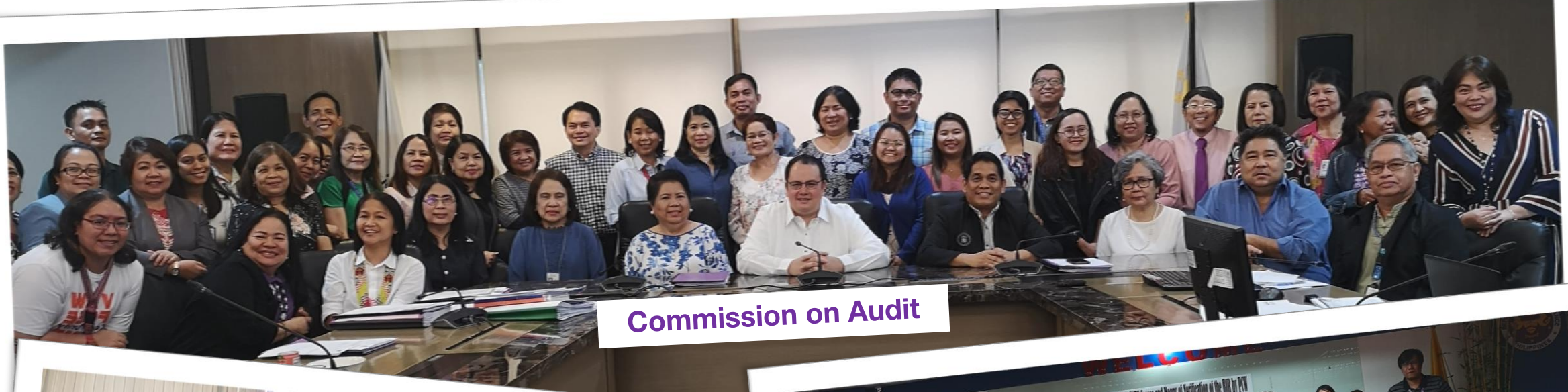
Commission on Audit