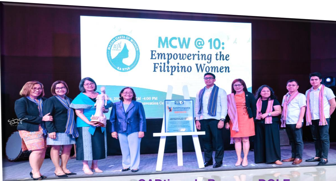
GADtimpala Bronze - DOLE