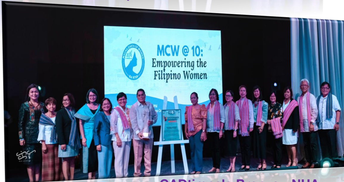
GADtimpala Bronze - NHA