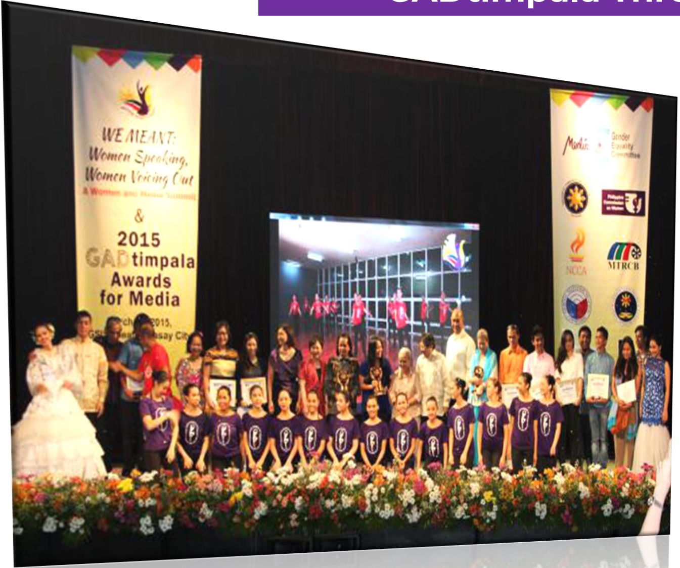
2015 GADtimpala Awards for Media