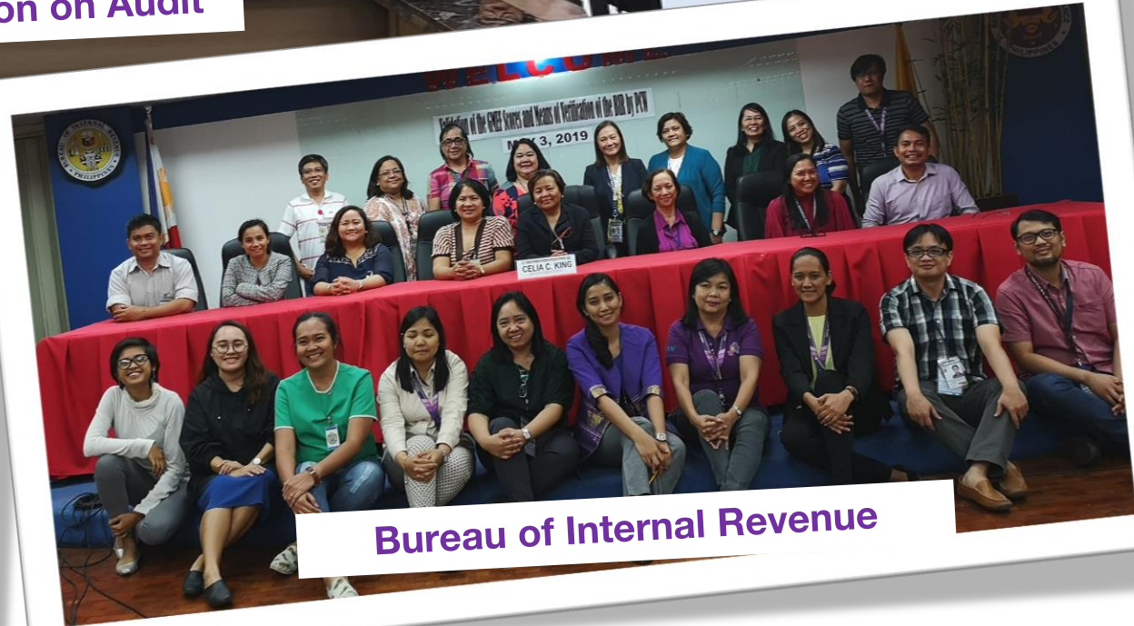
Bureau of Internal Revenue