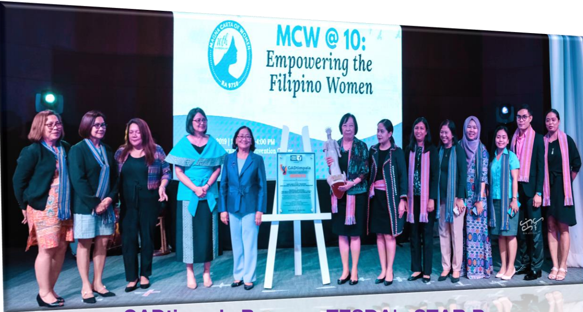
GADtimpala Bronze - TESDA's STAR Program