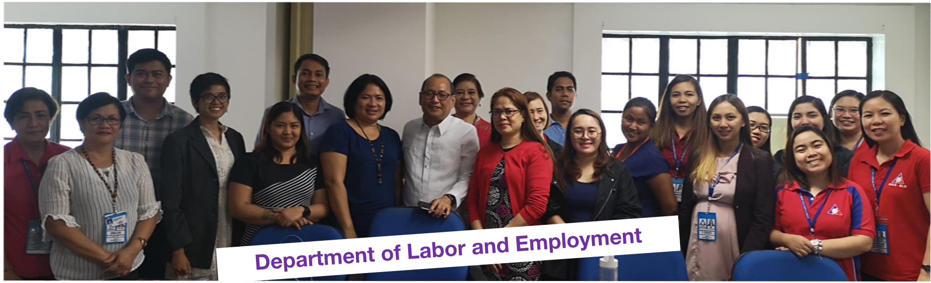
Department of Labor and Employment