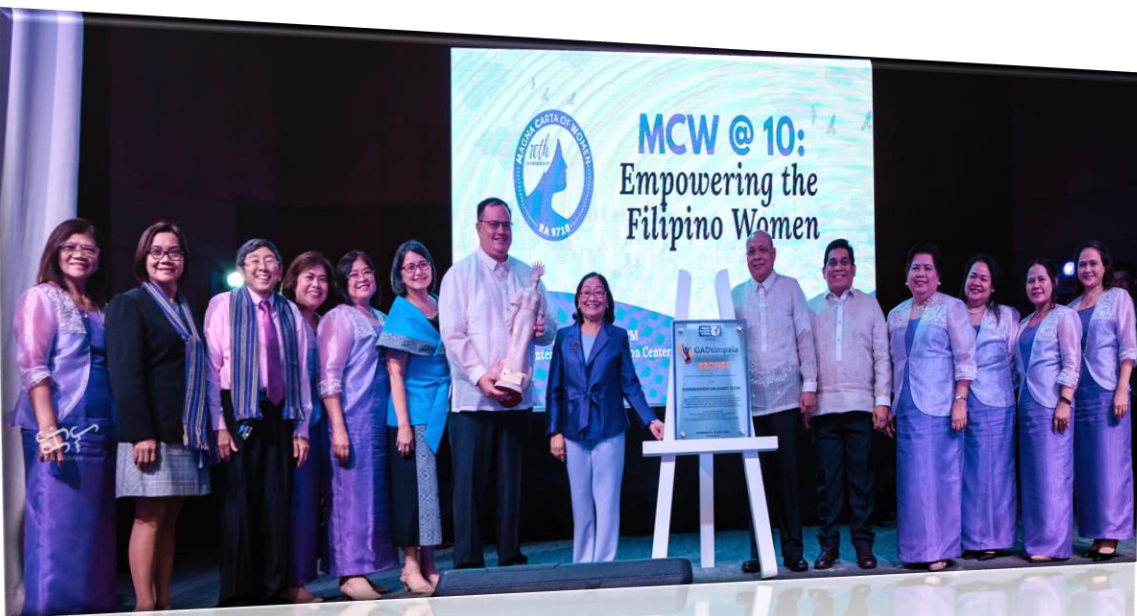
GADtimpala Bronze - COA