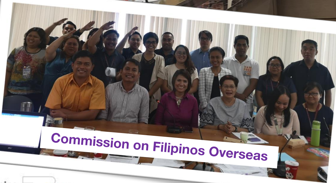
Commission on Filipinos Overseas