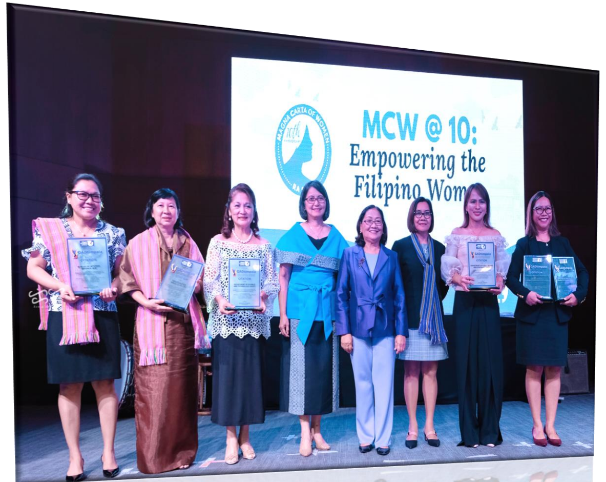
GADtimpala Citation - BIR, DA, DOST, DPWH, SHFC, and SHFC's Community Mortgage Project