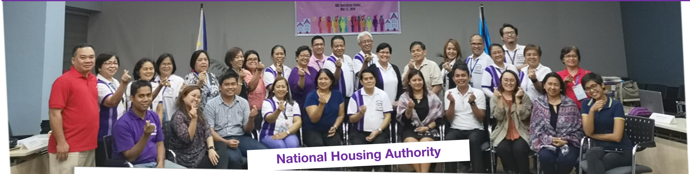
National Housing Authority