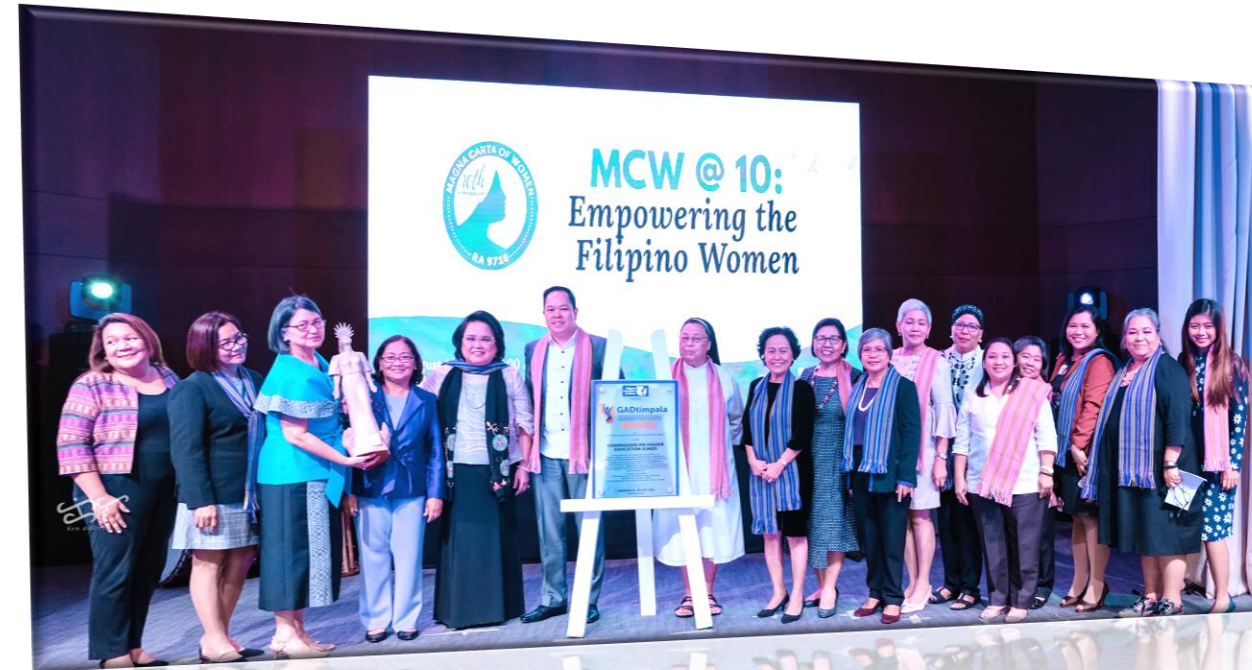
GADtimpala Bronze - CHED