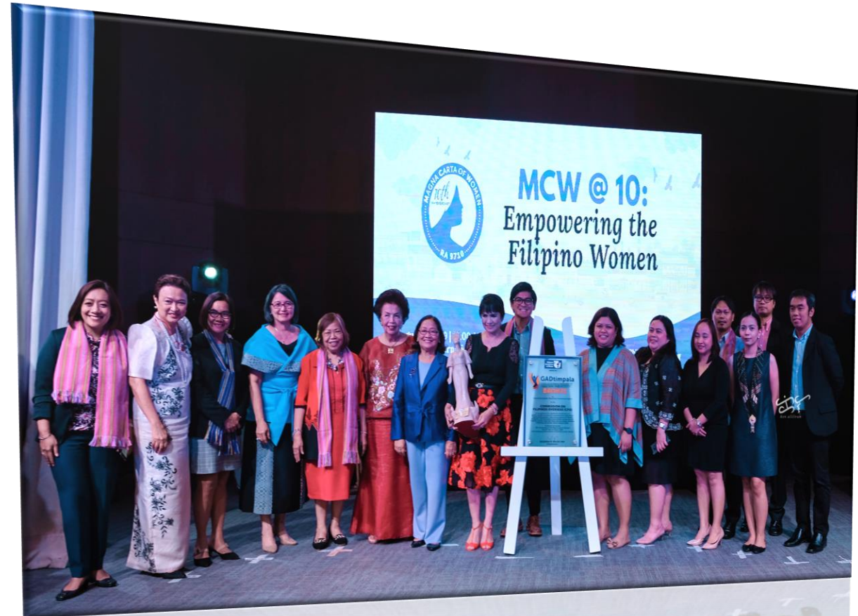
GADtimpala Bronze - CFO