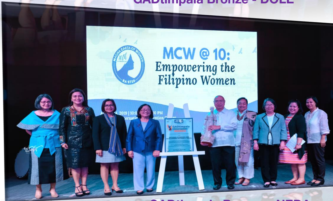
GADtimpala Bronze - NEDA