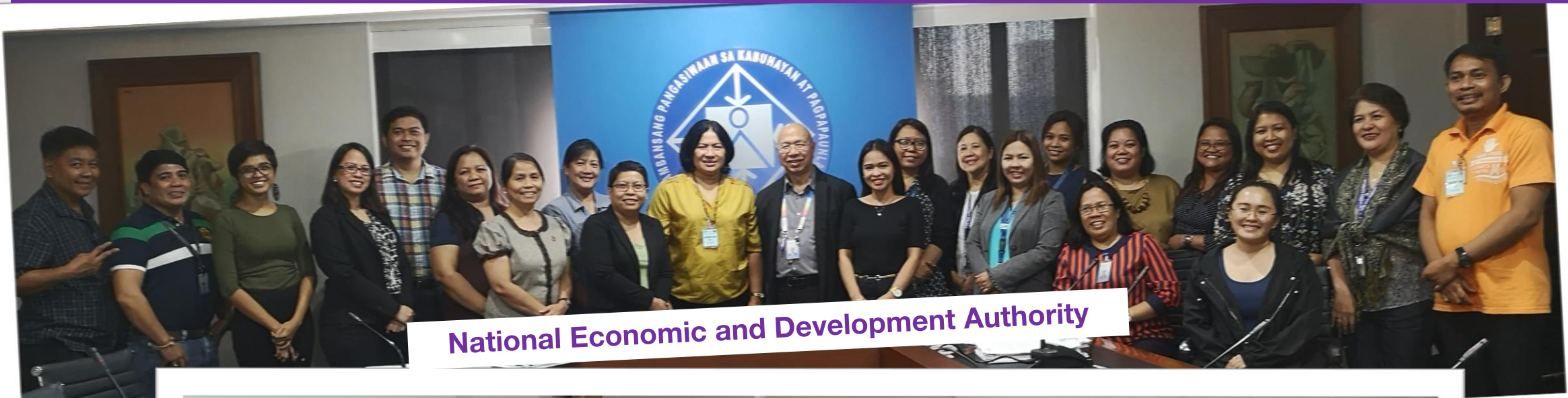
National Economic and Development Authority